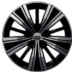
20" 5 Multi Spoke (#1186) std Ultimate Bright Recharge Plug-in Hybrid (Optional for B4 Mild Hybrid)