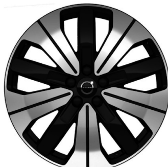
19" 5 Double Spoke (#1261)(std Plus Recharge plug-in Hybrid)