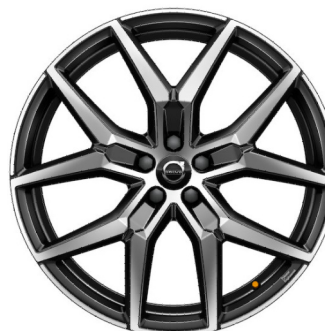
21" 5-Y Spoke (#1187) std Polestar Engineered