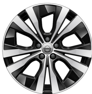
18" 5 Double Spoke (std Core)