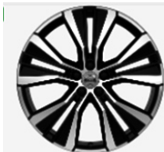
20" 5-Y Spoke (#1264) std Ultimate Dark