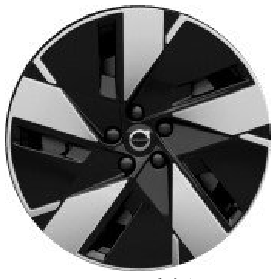
19" 5 Spoke (Std Plus)