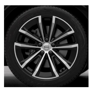
18" 5 Double Spoke (Diamond Cut) Alloy Wheels with 235/45 Tyres