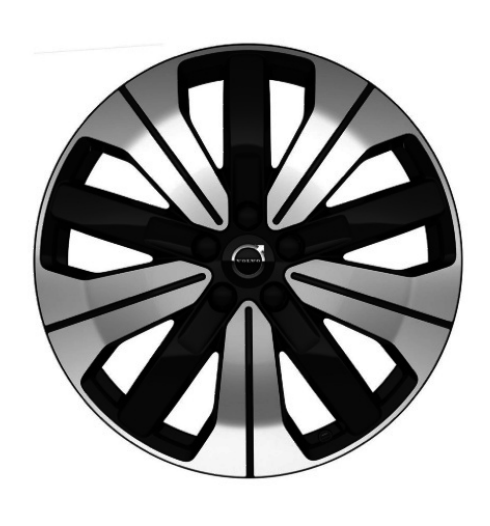
19" 5 Spoke (std Core and Plus)