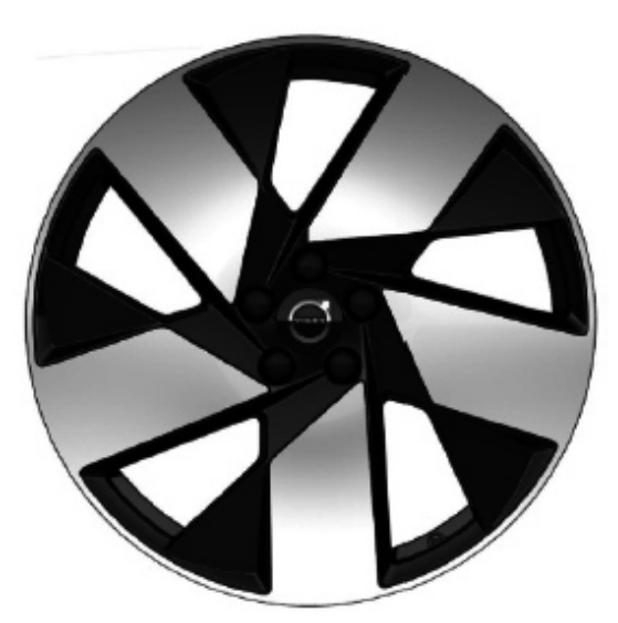
20" 5 Spoke (#1185) Std Plus C40 and Ultimate C40 and XC40